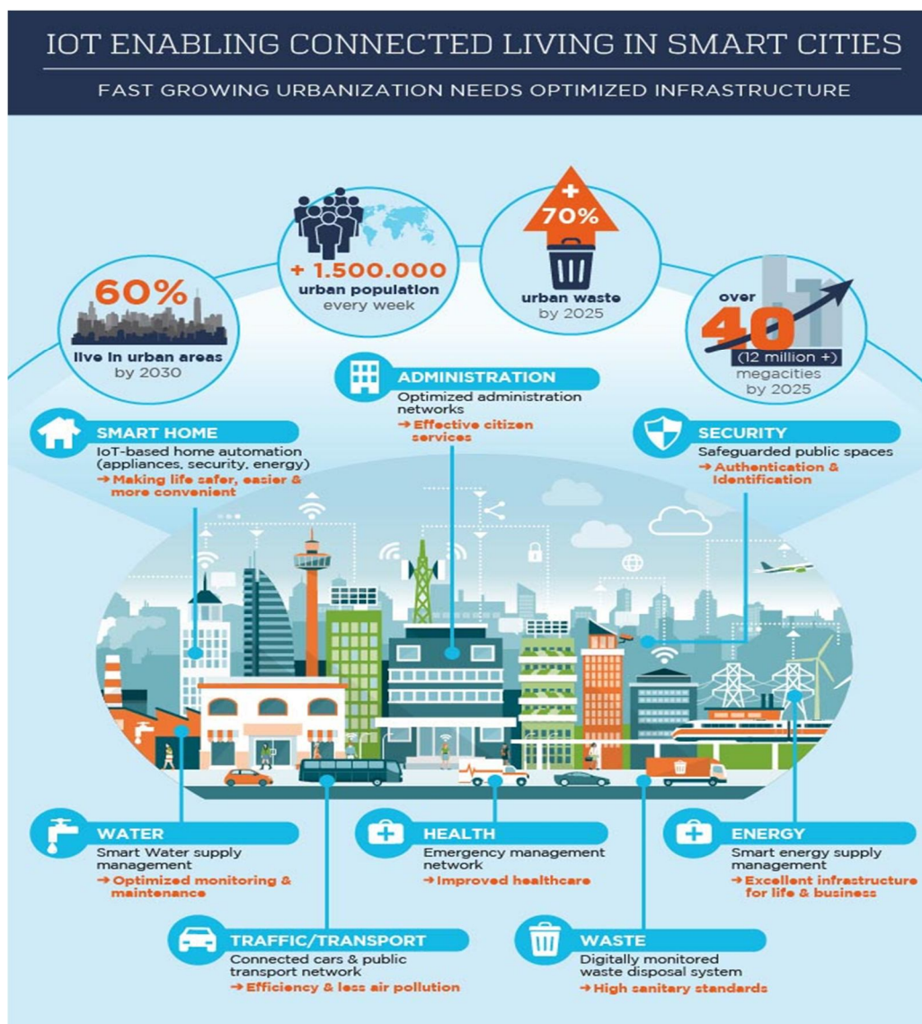
Figure2. Shows the IoT enabled smart city basic with benefits and sectors that would be affected