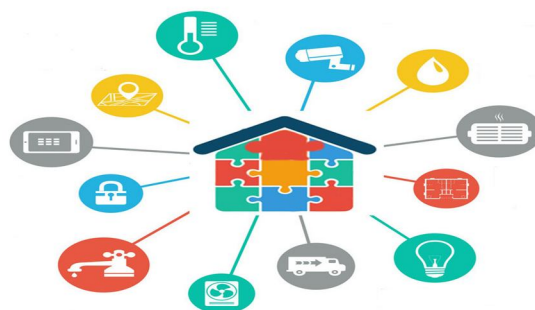
Figure 3. Smart Home Aspects