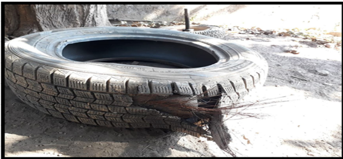
Scrap Tyre's Wire