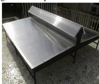
Fig 1 Solar conduction dryer

The Solar conduction dryer is a solar powered food dehydrator (Fig. 1) developed by a group of innovators known as Science for Society (S4S). The device utilizes solar power in a conductive manner as well as convective way for drying. The structure of solar conductive dryer which comprises of four drying chambers constructed from hollow sections of stainless steel. The dryer has four drying trays, covering a surface area of 1.04 m 2 each. Transparent plastic (PC Multiwall Sheet) is used to cover the trays. The trays are coated with black color special food grade coating, where the products to be dried are placed.