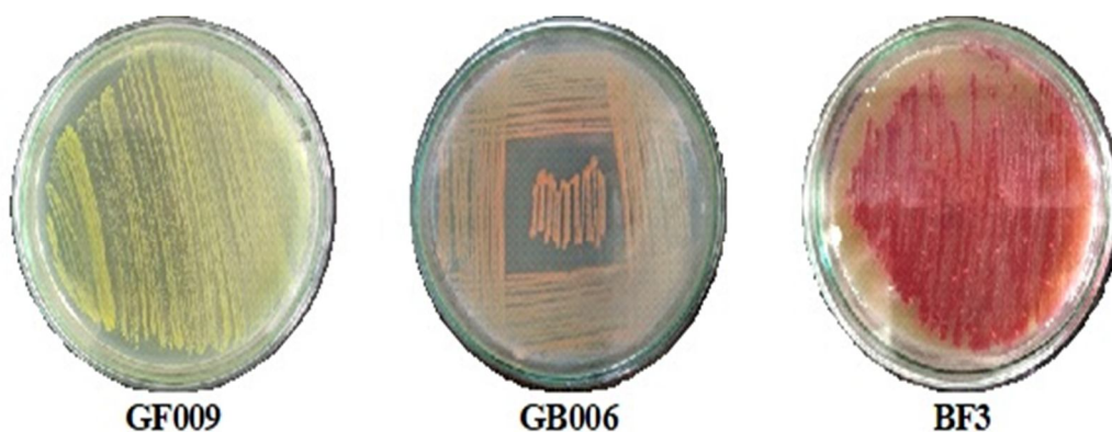
Figure 1: Cultural characteristics

Figure 1 shows Nutrient agar showing pigment producing organism isolated from soil and water samples from the sample sites of Khyati Institute of Science, Ahmedabad. .