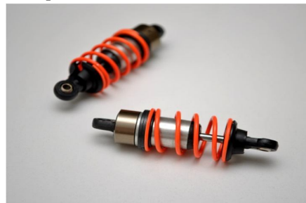
Fig 1.1: Mini Shock Absorbers

The Harvested energy in the regeneration process is enough to reach the energy requirement in consumption process, which concludes in the decision that suspension is self powered.