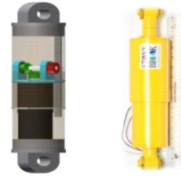
Fig 2.2 Shock absorber Prototype