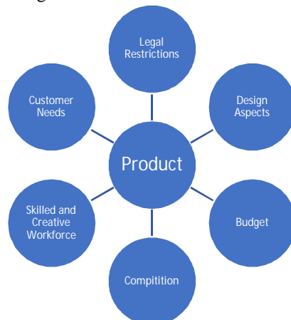
Fig. 2 Factors affecting product development [12]

When improvement any product organizations has to think about various factors. The significant factors to be considered from product development point of view are shown in figure 2.