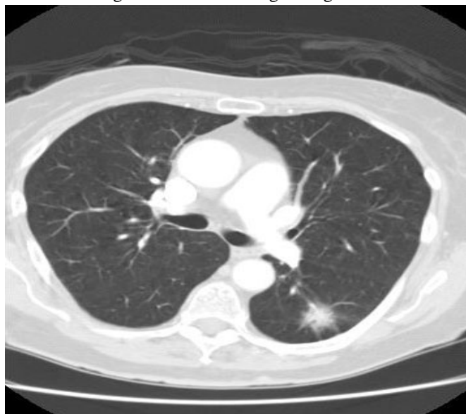
Fig 1. Image of lung cancer nodule [1]