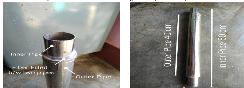
Fig.: Pipe assembly

Two co-centric steel cylinders are taken for experiment. The space between these co centric cylinders are filled with insulating material like Cotton and Recycled polyester fiber. Inner cylinder is heated by the apparatus and the consecutive readings of V (voltage) and I (current) are noted down to calculate the value of heat supplied. Heat will be conducted from inner cylinder to outer cylinder by the mode of "Conduction". Temperatures of inner and outer surface are taken by use of thermocouple and at last their average mean value s taken to reduce the possibilities of error during the experiment process.