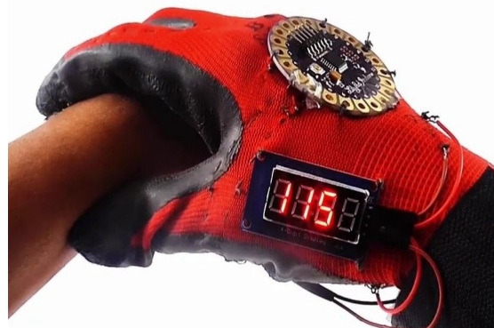
Fig. 3 Glove

In this project we are using Arduino micro controller to develop IoT based application. For elderly persons, Help to You (H2U) is developed that measures heart beats and blood pressure of the person is measured continuously. Pressure sensor measures the pressure and Systolic and diastolic pressure is calculated. The heart beats are measured by Heart beat sensor. If heart beats or Blood pressure become abnormal, SMS is sent to doctors or family members along with current location of that person. Location is tracked by using GPS modem. Buzzer also sounds at that time. The parameters of the person are displayed on the webpage that can be accessed from anywhere.