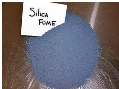
Figure 1. Silica Fume