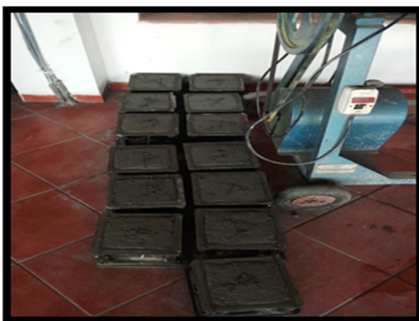
Figure 3. Cube Casting

The mixing of ingredients of concrete was done using electric concrete mixer machine. As per the guidelines of the IS Code 15388:2003, silica fume and plastic waste concrete is prepared on M30 concrete. Plastic waste such as 0%, 10% and 20% was added in percentage, in order to replace the same amount of aggregate. Silica fume is added in 0%, 6%, 9% and 12% to replace the same amount of cement. Standard cube of size (150mm*150mm*150mm) was used as specimens for determination of compressive strength of concrete. These specimens were tested for 14, 28 days strength.