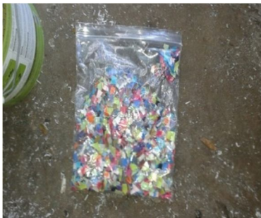
Figure 2. Plastic Waste