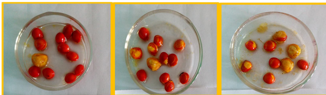
Plate: 5-H 2 SO 4 Scarification of Abrus precatorius , L.; (Sample-3)