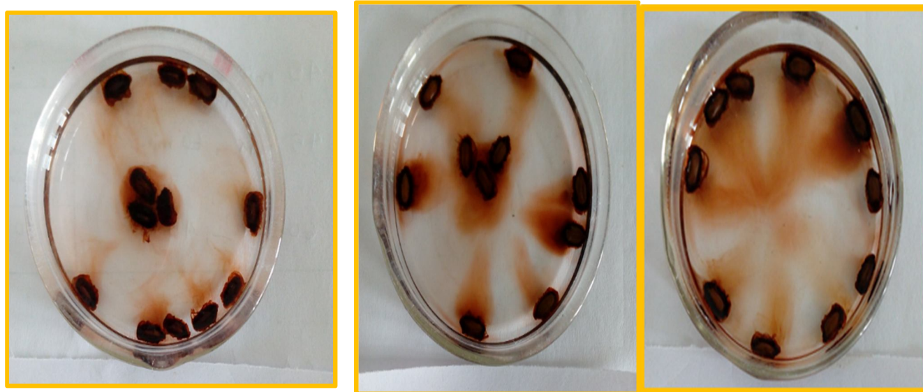
H 2 SO 4 Scarification –