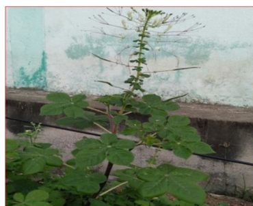
Plate: 3- Habit of the selected sample

Cleome gynandropsis , DC.; is a common plant occurring throughout the tropics and subtropics of Africa, (Srinivas et al., 2014). It is an annual leafy herb. It is used as a medicinal plant and can be found in all over world. It grows as a weed in paddy fields and also in road sides and in open grass lands. In India it is never cultivated but grows spontaneously everywhere. It has a long taproot with a few secondary roots with root hair.