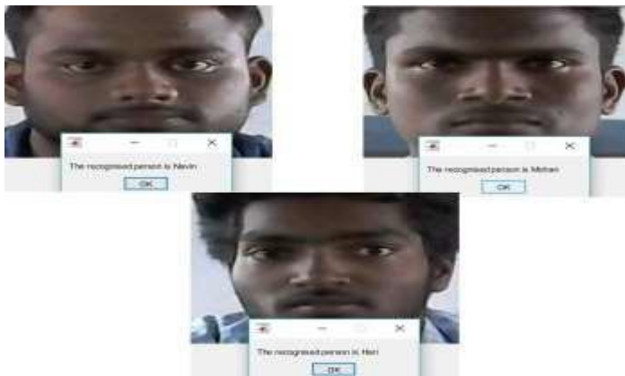
Figure 3 Face recognition