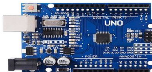
Fig: Arduino Atmega 328p circuit board