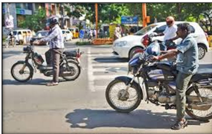
Image 2: People standing on the Zebra Crossing