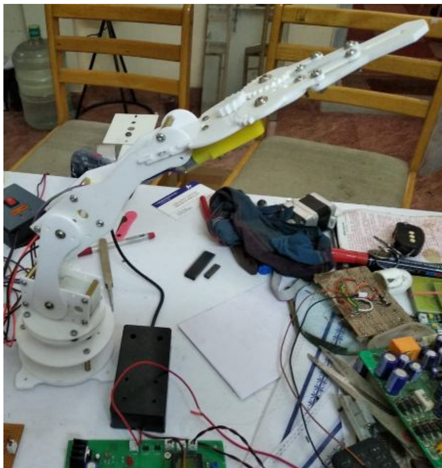
Fig 4. Fabricated Material Recognizing Robot