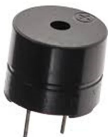
Fig. 6 Buzzer