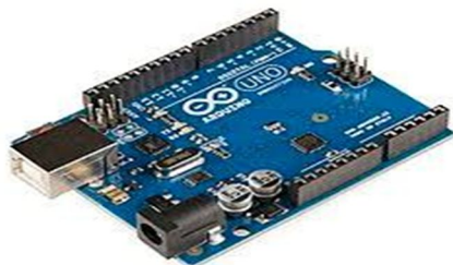
Fig. 2 Arduino Uno Board