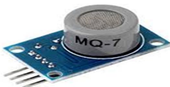
Fig. 4 CO 2 Sensor