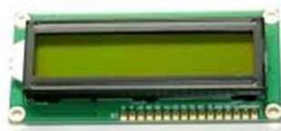
Fig. 5 16*2 LCD Display