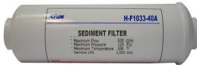
Fig. No. 2 Sediment Filter