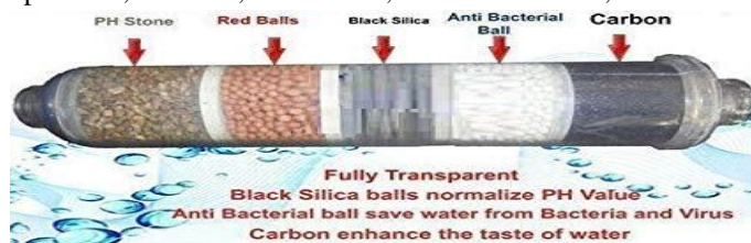
Fig. No. 5 Alkaline Membrane