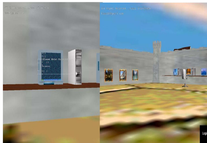
Figure 3 – (a) Snapshot of a proof-of-concept 3-D virtual environment, where the user is typing a textual password on a virtual computer as a part of the user's 3-D password. (b) Snapshot of a proof-of-concept virtual art gallery, which contains 36 pictures and six computers

(4, 34, 18) Action = Typing, "F"; (4, 34, 18) Action = Typing, "A"; (4, 34, 18) Action = Typing, "L"; (4, 34, 18) Action = Typing, "C"; (4, 34, 18) Action = Typing, "O"; (4, 34, 18) Action = Typing, "N"; (10, 24, 80) Action = Pick up the pen; (1, 18, 80) Action = Drawing, point = (330, 130).