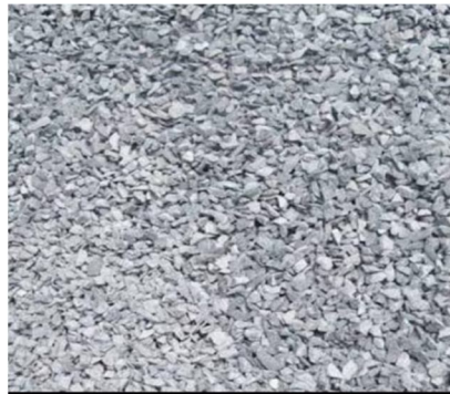
Fig 2:Coarse aggregate(10mm)

The coarse aggregate particles passing through 12.5mm and retained on 4.75mm IS sieve used as the natural aggregate which met the grading requirement of IS 383-1970