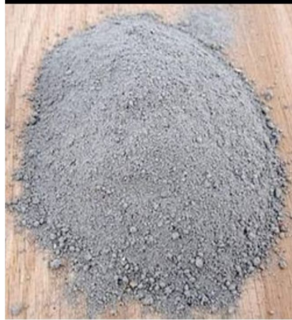
Fig:1 OPC grade 53 Cement