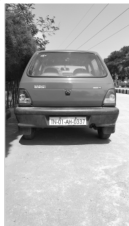
Fig.3) Gray image