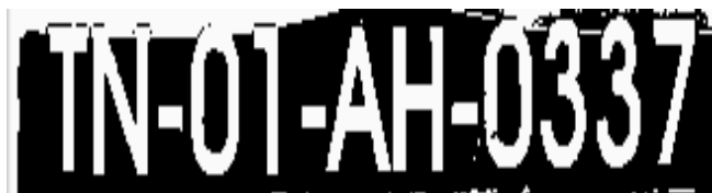
Fig.10) Cropped image