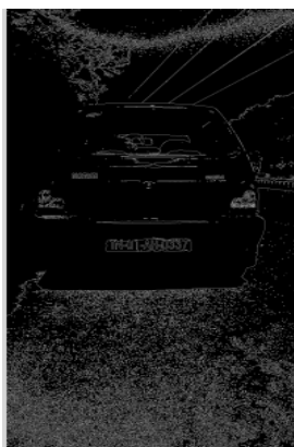
Fig.6) Edge detection