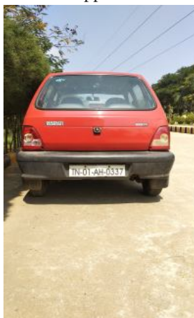
Fig.2) Original image

The following figures represents the experimental outputs obtained by low cost embedded board raspberry pi 3 coded with opencv python. Fig.2) displays the original image obtained as a result from the low movement detection algorithm. Fig.3) is the converted image from RGB to Gray scale image for further process. Fig.4) is the output on performing histogram equalization on the gray scale image. Fig.5) shows the binary converted image from the original image. Fig.6) represents edge detection which is the result of applying canny operator to the binary image. Fig.7) enhances the pixels and helps in finding contour. Fig.8) represents all contours (purple) and exact contour for number plate (green). Fig.9) brings out a enhanced number plate from the previous result. Fig.10) is the exact number plate identified and cropped automatically.