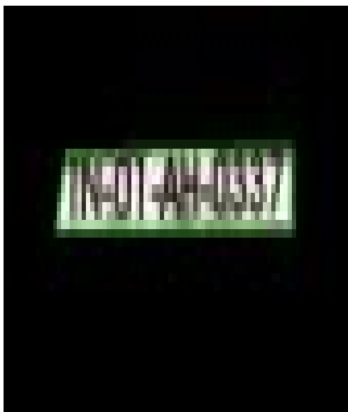
Fig.9) Enhanced number plate