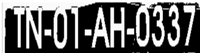
Fig.10) Cropped image