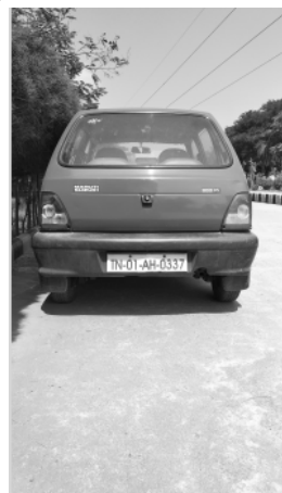
Fig.3) Gray image