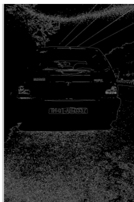
Fig.6) Edge detection