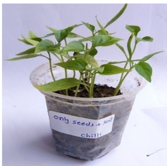
Fig.4 plant growth of seeds without treatment