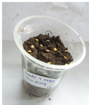
Fig.3 seeds with microbial consortium and cow dung.