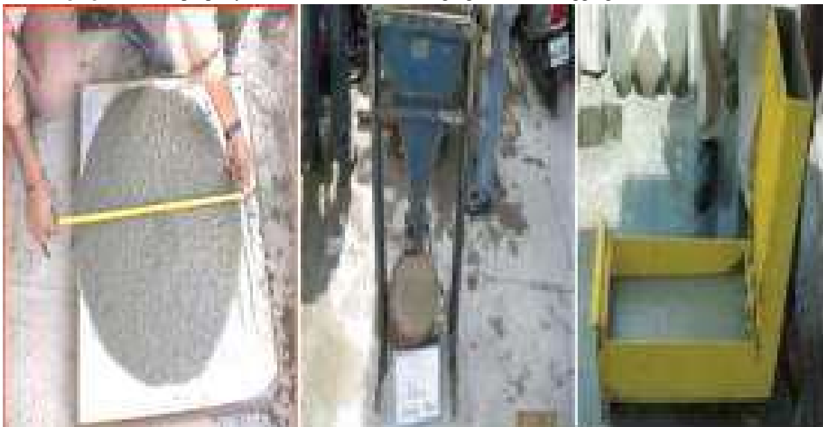
Fig. 1: Slump Flow, V-Funnel, l-Box Test