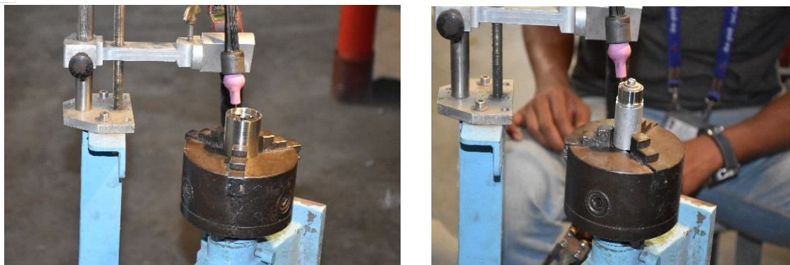
Fig 6: Microwave components holding fixture during welding