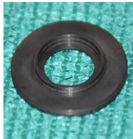
Fig 4: Soft Iron material Components