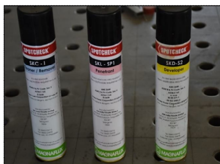
Fig 7: Cleaner, Penetrant & Developer of DP test