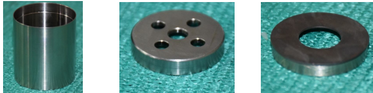
Fig 3: Monel-404 material Components