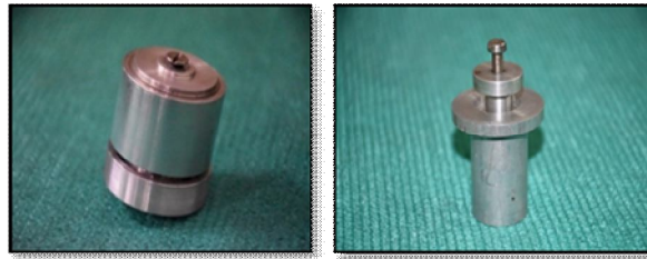
Fig 5: Microwave components holding fixture