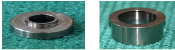
Fig 2: Kovar material Components