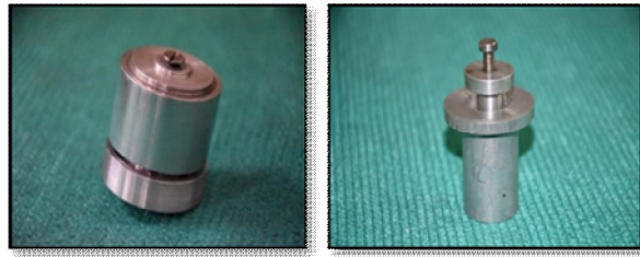
Fig 5: Microwave components holding fixture