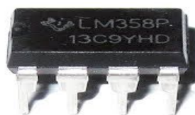
Figure 3-LM358P IC

Full bridge rectifier is used to convert AC to DC.