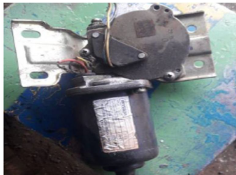
Fig.2 DC Motor

As we know motor is a device which converts the electrical energy form into mechanical energy form. There are lots of types of DC motors available in market from 5RPM to 5000RPM which is powered by DC current. And some are divided on voltage input for DC motor some common voltage inputs are starts from 3V, 5V, 12V, and 24V. There are advantages for DC motor is it provides excellent of controlling the speed. For better result on our system we used wiper motor of car which works on 12 V DC supply and provide best speed control as we required.