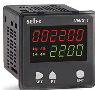
Fig. 1 PLC

Solar panel which receives the light from sun which it further converts it electricity and heat energy. A photovoltaic module/array is designed by number of solar cells are connected together in series and parallel.