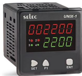
Fig. 1 PLC