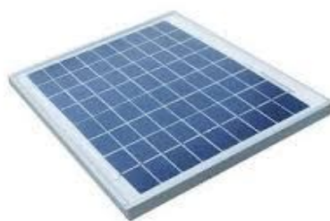
Fig. 2 Solar Panel

Solar energy is a renewable, freely and easily available, clean, energy source from nature. The sun daily produces a huge amount of energy of heat as well as light energy through sustained radiations which is used for heating and electrical energy production. Among the non-conventional sources of energy solar energy is the most promising. Hence we give priority to use the solar energy conversion to electrical energy to run a normal grass cutter.