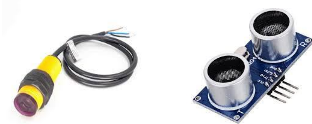
Fig. 3 Infrared Sensor and Ultrasonic Sensor

Ultrasonic/IR sensor is a device that can check the obstacle or an object by using either sound waves or light beam. It measures distance by sending out a sound wave or light beam at a specific frequency and listening for that signal wave to bounce back. By recording the elapsed time between the sending and receiving wave being generated and the sound wave bouncing back.