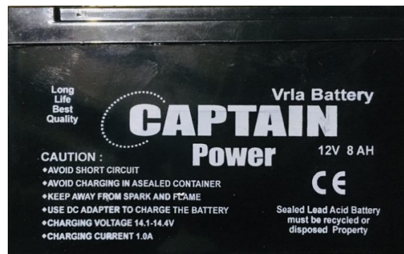
Fig. 2 Battery Source