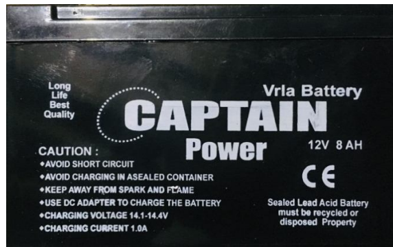
Fig. 2 Battery Source