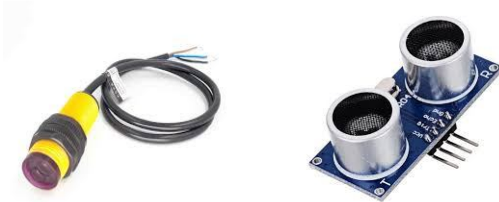
Fig. 3 Infrared Sensor and Ultrasonic Sensor

Ultrasonic/IR sensor is a device that can check the obstacle or an object by using either sound waves or light beam. It measures distance by sending out a sound wave or light beam at a specific frequency and listening for that signal wave to bounce back. By recording the elapsed time between the sending and receiving wave being generated and the sound wave bouncing back.