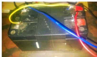
Figure 2:- 12 V Battery