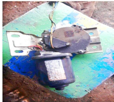
Figure 4:- DC Motor