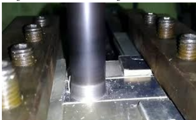
FIG – 1 EXPERIMENTAL SETUP

In this research work we used aluminum alloy 6061 as a base material and its chemical composition is given in table 1. Rectangular aluminum plates of 90*30 mm were lap-welded by friction stir welding process. Thickness of base plate is 4mm. A vertical head milling machine was used for the experimental work which is located at work shop of LDRP. Fig 1 show experimental setup of friction stir lap welding. The lap joints were prepared for single lap and double lap. Tool used for friction stir lap welding is made from H13 material having conical pin profile. Dimension of conical pin used in this research are upper pin diameter is 2mm, lower pin diameter is 6mm and pin length used in this research is 6.2mm which is greater than thickness of upper plate. The welding parameters used in this investigation are given in table 2. Outline of single line and double line is shown in fig 2(a) and (b).