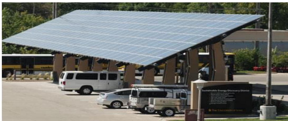
Figure 3 shows a photograph of solar charging station cum shade in a European country