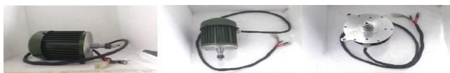
Table 6: Technical specification of E-Rickshaw motor