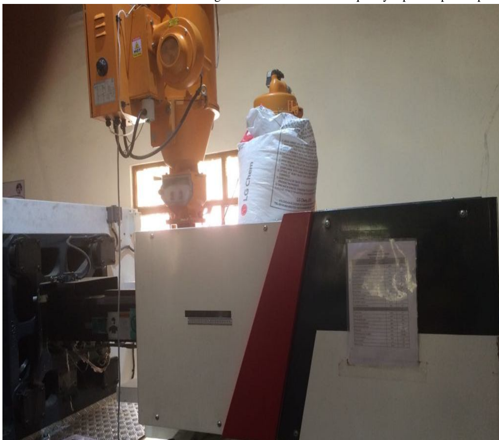
Figure 1: PIM machine used for experimentation

The analysis was done on a plastic injection molding machine with fixed column and moving table as shown in figure 1 named as Electron-155 PIM. The raw material which is used in this research is thermoplastic which will be used to make top cover of food packaging box. This examination was conducted by using design of experiment (DOE) strategy named as Taguchi Method [8]. The essential execution measure in PIM is dimensional shrinkage which demonstrates the quality aspect of plastic product. [9].