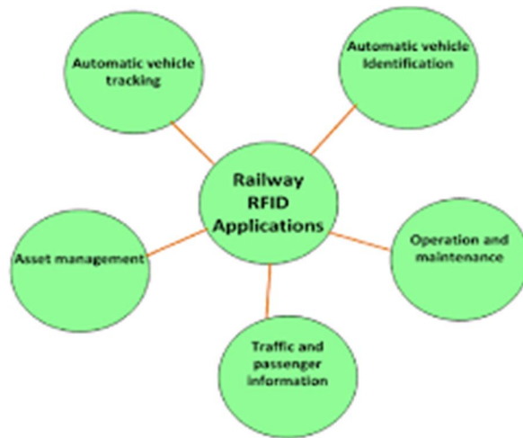
Figure 2.1.2 RFID Applications

1) RFID Technology : Electric appliances that can detect energy as the reading and can display them are called electric meters. Traditional meters are used in the late 19th century. They exchange data between electronic devices in computerized environments for both power generation and distribution.