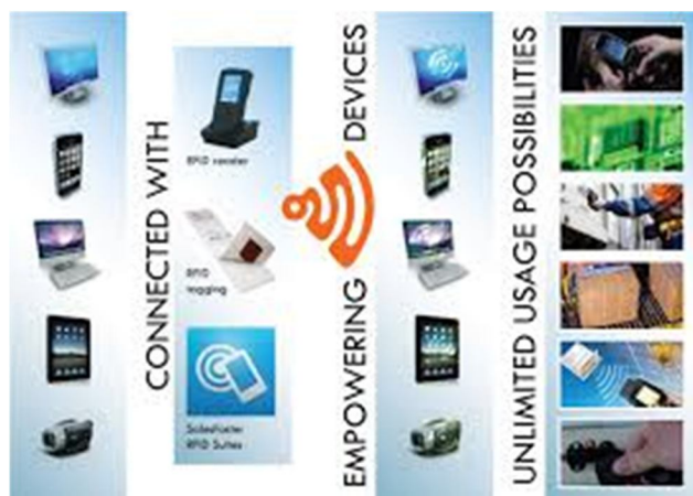
Figure 2.2 Smart usage

Smart Meter is an environmentally friendly energy meter that is used for measuring the electrical energy in terms of KWh (Kilowatt - hours). It is simply a device that affords a direct benefit to the consumers who want to save money on their electricity bill. [6] They belong to a division of Advanced Meter Infrastructure and are responsible for sending meter readings automatically to the energy supplier. A simple picture of a Smart Meter is shown below.