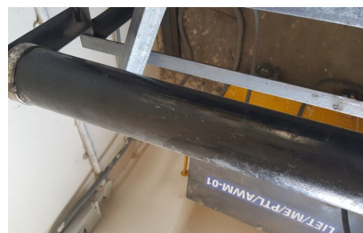
Fig. 4. Circular Cylinder