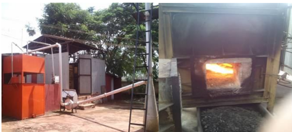
Fig. 2 Incinerator at Khasbhag, Belgaum

They are following the standard color coded bins for collection and storage of waste. They are segregating the wastes at the point of source itself. The infectious waste is carried to the incinerator present in Khasbhag area Belgaum by a closed vehicle once in a day. The Khasbhag incinerator is being managed by Association of Hospitals and nursing Homes, Belgaum. They are charging 15 rupees per kg.