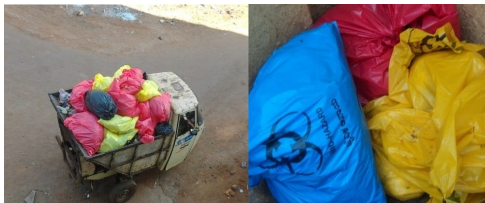
Fig. 3 Transportation and Segregation of the Waste at BHS Lakeview Hospital, Belgaum