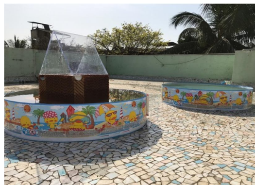
Fig. Represents : Case Study on the left and testing of model on the right.