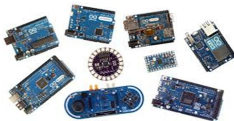
Fig. 1 Arduino Boards