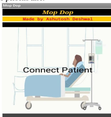
Fig. 6 MopDop Mobile Application

When a person wants to communicate with speech disabled persons, deaf peoples, patients or old aged peoples they just simply have to connect their mobile phones with the MopDop device (shown in figure 5) using mopdop mobile application (shown in figure 6). Once the mobile phone gets connected they can now start a communication or conversation. The disabled persons choose a relevant touch point after that an image shown on the mobile phone screen with a message and virtual voice. In this manner they can make a conversation between themselves and with other persons also.