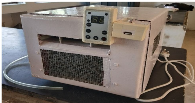
Figure 3: Air Conditioner Unit