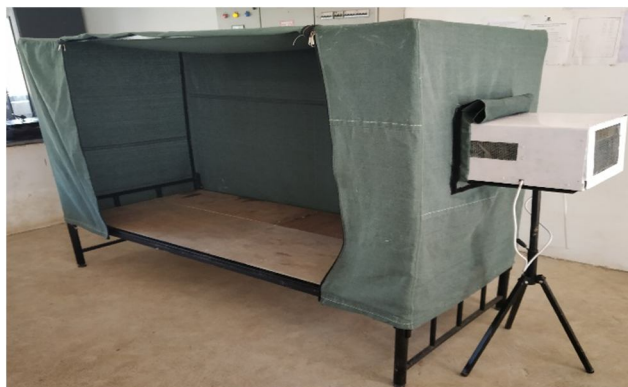
Figure 5: Cot covered with cloth and ac unit Confined area: 192×82×151 cm