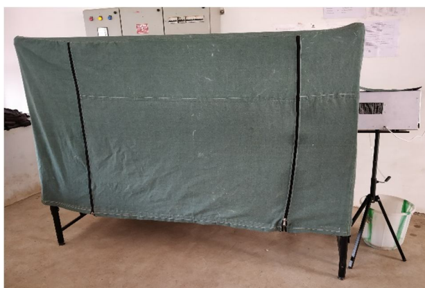
Figure 6: Enclosed System