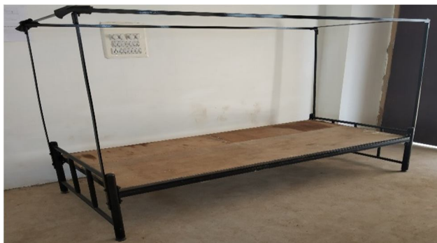
Figure 4: Sleeping Cot