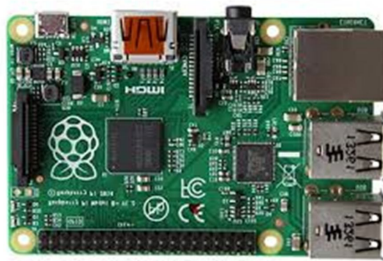
Figure 2: The Raspberry Pi Model