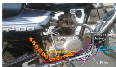
Fig. 3.1 Air Preheater installation on vehicle

Following figure 3.1 shows the actual construction of air preheater. The exhaust manifold mounted on the cylinder head of an engine collects a gas exhausted from an engine, and sends it to a silencer which consists of catalyst converter. This exhaust gases heats the silencer. On that silencer fins of galvanized copper are provided. These fins having mounted in such a way that its axis is parallel to axis of silencer. These fins are surrounded by air preheater. Air preheater comprises parallel flow form of device created of pipe that|during which|within which} Silencer of hot flue gases is encircled by contemporary atmospherical air which is enclosed in a pipe having no. of air gap at front facet for the entry of contemporary air. Drain screw is provided to remove any debris, dust or impurity collected in air preheater. Air preheater conjointly having mammilla that is followed by hoses that provide heated air to the air intake chamber.