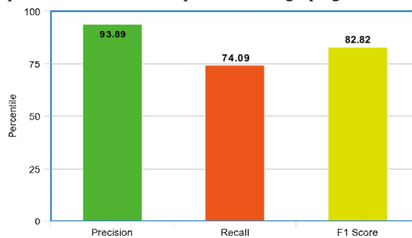
Figure 2 Metrics value

The values calculated on the basis of precision and recall are plotted in the graph given above.