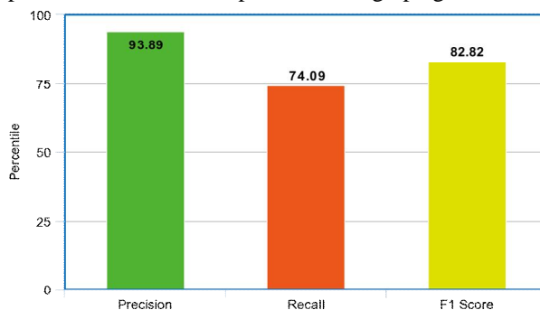
Figure 2 Metrics value

The values calculated on the basis of precision and recall are plotted in the graph given above.