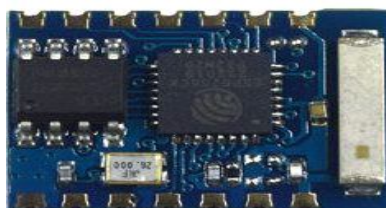
Figure : Esp8266, Wi-Fi module.