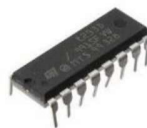
Figure 3. ICL293D