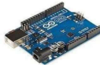
Figure 2. Arduino UNO

USB-to-serial driver chip. Instead, it uses the Atmega16U2 (Atmega8U2 up to version R2) programmed as a USB-to-serial converter.