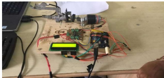
Figure 5. Implemented Circuit

By the end of the project, a successful working prototype was made. The ARDUINO BASED SMART STOVE was developed by using an Arduino UNO, L293D motor driver IC, DC motor and a gear. This is absolutely a low cost project, which is implemented with some modifications in the existing stove. At a time it is an advancement in technology and also cost effective. The smart stove can be effectively used in our kitchen and it is simple, user-friendly and can be installed very easily. This project will be a boon for all the homemakers. Finally the prototype was made successfully with the help of Arduino UNO, DC motors and drivers. And we successfully implemented the circuit.