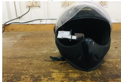
Figure 3 Prototype developed