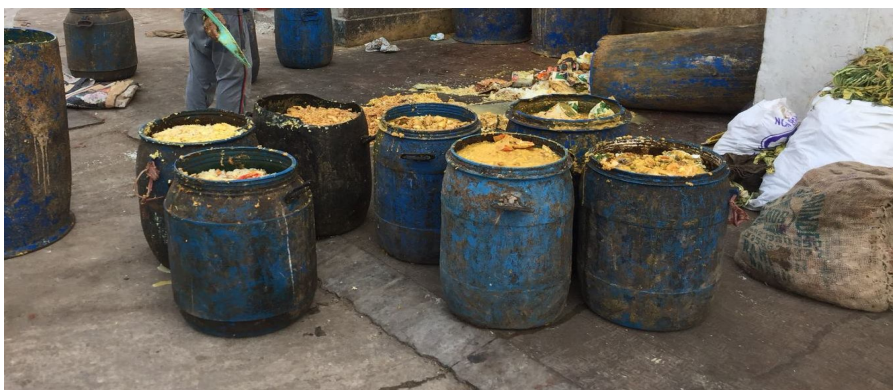
Figure-1 Biodegradable waste

The biodegradable waste disposer provides assistance in the direction of waste decomposition. The unit provides various advantages as compared to the currently used decomposition methods. The unit is easy to install as well as easy to operate. It did not require any skill for the decomposition of the waste so even an illiterate person can operate it. One of the major benefits of this unit is that there is no need to accumulate a waste at a particular place and transfer it to the plant where it is decomposed so that the use of dumping sites reduces. The motivation for this project came into mind as we look around in our society. The waste of the university and our society is not disposed properly. The management of Municipal Corporation fails to dispose waste in an efficient way. Like any other educational institute, colonies, firms and societies our university produces a large amount of biodegradable waste including residual food from mess and canteen, residuals of vegetables and leaves. This waste is not disposed properly and causes foul smell and various diseases. Thus this waste needs to be disposed so the idea of making a waste disposer is generated.