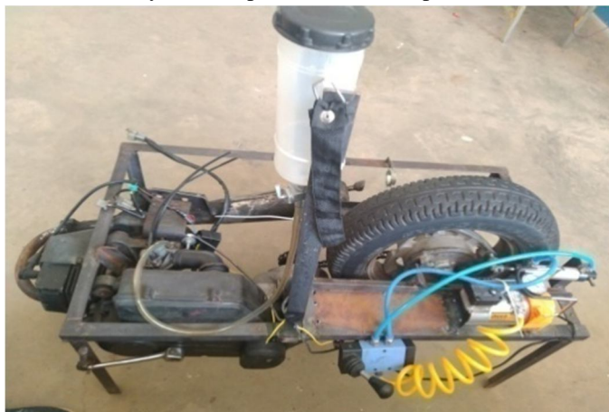
Fig 6.Final project photo “Air Braking System Using Alternator