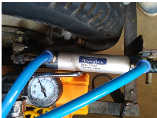
Fig 3: Double acting pneumatic cylinder

It is a double acting cylinder which is connected to the brake link as the pneumatic value is actuated the air from compressor enters into the cylinder and tends to move the piston due to which extraction process takes place, as the value is operated in opposite direction the retardation process take