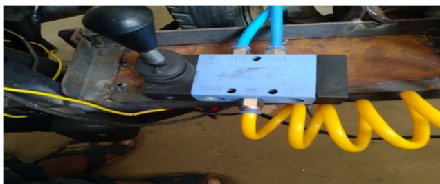
Fig 1:3/2 Pneumatic valve