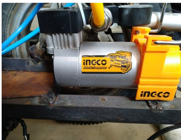
Fig 2: Air Compressor

The compressor used is mini air compressor of 140psi max pressure. It sucks the air from atmosphere compresses it and sends it to the pneumatic cylinder when the valve is operated, it is powered by 12v battery.