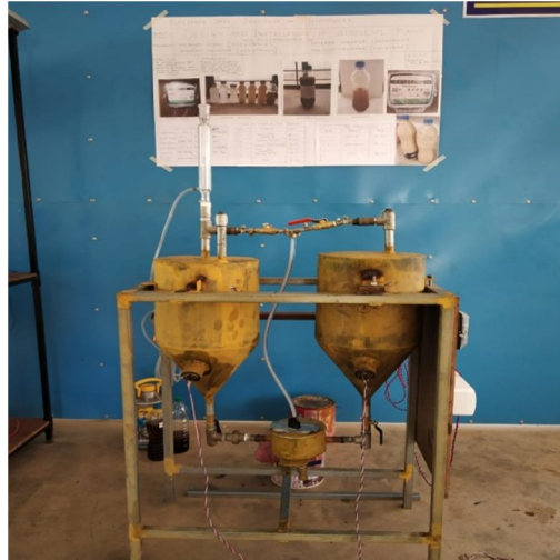
Fig 5 :Biodiesel plant