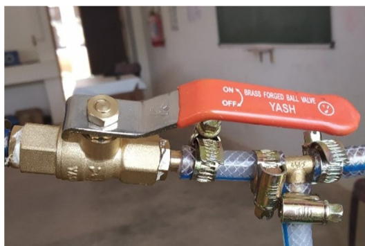
Fig 4 Valves

There are 2 types of valves used such as two way valves and single way valves and it is made from Brass –chromium.