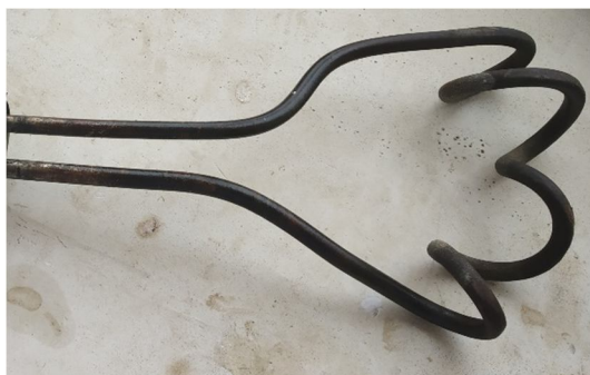
Fig3: Heating coil

Consumes power around 220V-240V, 60Hz, 500W. It is made of aluminium/iron.