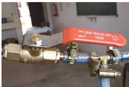
Fig 4 Valves

There are 2 types of valves used such as two way valves and single way valves and it is made from Brass –chromium.