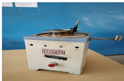
Fig 12: Claveland Flash and Fire point Apparatus