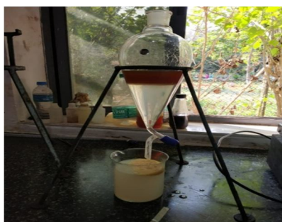
Figs7: separation of raw biodiesel and glycerine