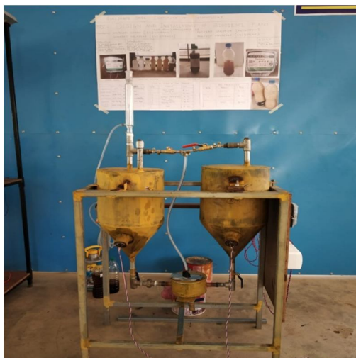
Fig 5 :Biodiesel plant