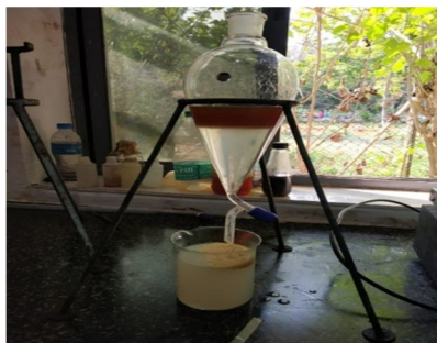
Figs7: separation of raw biodiesel and glycerine