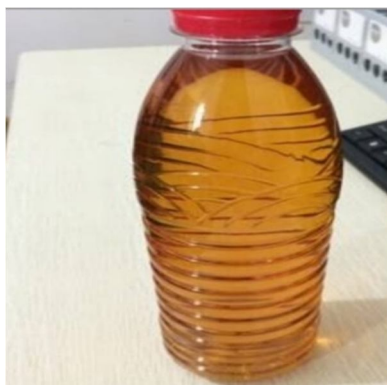
Fig6: filtered waste cooking oil

After cooling we get the final product in the form of biodiesel which after carrying out certain blends over test which tends to tell the percentage of biodiesel, which mixture of biodiesel can be helpful for engine to perform better mostly the blends used are B20, B8, etc.