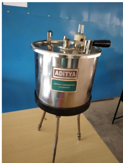
Fig 13: Saybolt Viscometer apparatus