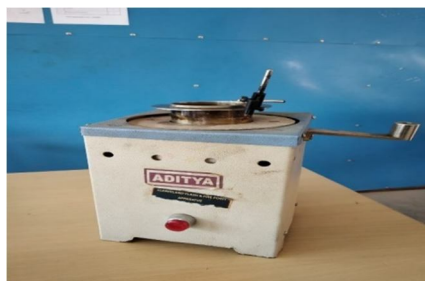
Fig 12: Claveland Flash and Fire point Apparatus