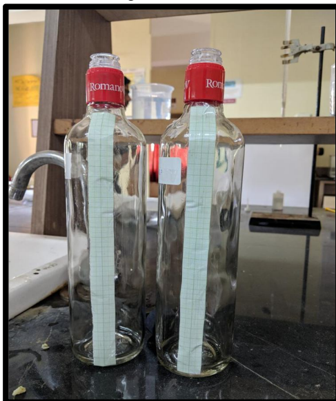
Fig 2.12:- Reactors showing marking for settlement measurement

After design of the proposed reactor actual work of filling was started. In the initial stage the reactors were named and are attached with the reading strip to take the readings of settlement of organic matter over the time as shown in the following figure