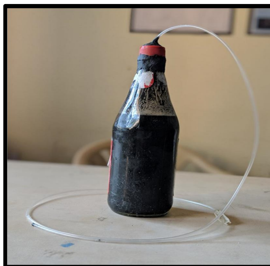
Fig 2.1 :- Bottle filled with Sludge

Sludge was collected from Akurdi STP for the project. Sludge collected was first tested in lab on the basis of physical parameters and then it was selected ensuring its reaction with sufficient reaction time.