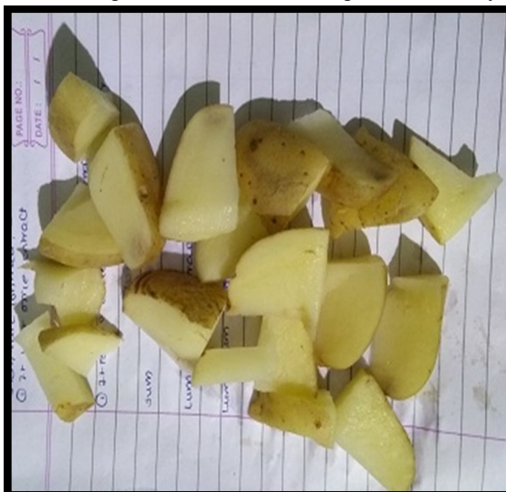
Fig 2.2:- Conventional Potato

The total volume of single reactor was 750 ml out of which 600 ml was mixture of organic waste (Rice, potato, Roti, mix) and sludge in the proportion of 1:2. The proportion of mix is 1:1:1 of rice, roti and potato. The density of potato is 0.591 gm/ml hence its weight for 200 ml was 118 gm. The density of rice is 0.730 gm/ml hence weight for 200 ml was 146gm. The density of wheat is 0.770gm/ml hence its weight for 200 ml was 154 gm. The density of mix is 0.700gm/ml hence its weight for 200 ml was 140 gm.