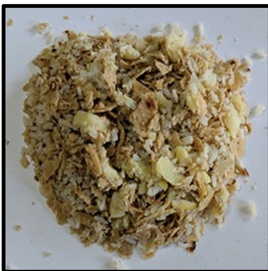
Fig 2.8:- Conventional Mix