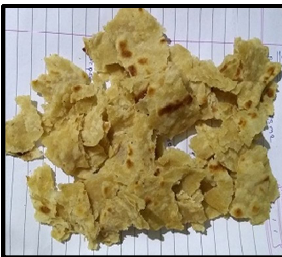
Fig 2.6:- Conventional Chapati