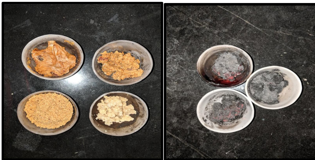
Fig 2.15 :- Sample from the oven at 105 0 C. Fig 2.16 :- Samples after muffle furnace.

All the reactors were sealed properly and checked for any leakage. After checking properly of any leakages all the reactors were placed at room temperature and were properly monitored till the end of reaction time. Following table showing methods adopted.