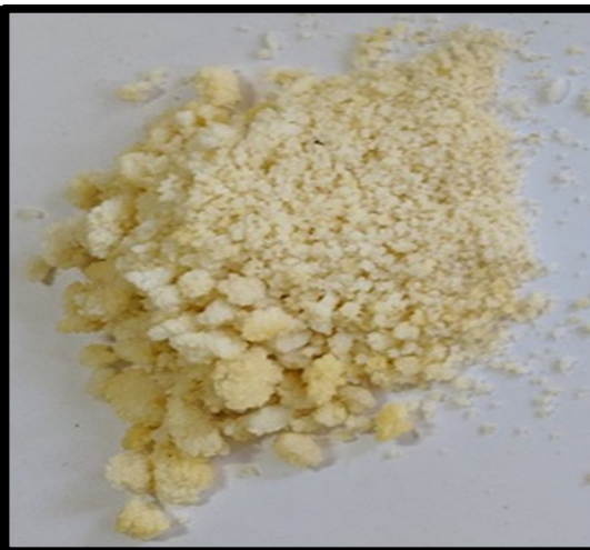
Fig 2.4 Pretreated Rice