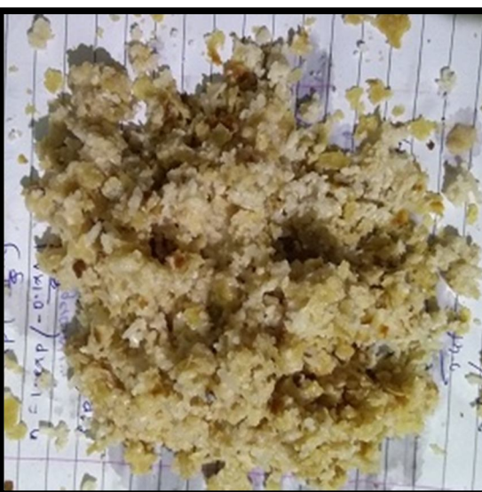
Fig 2.9:- Pretreated Mix