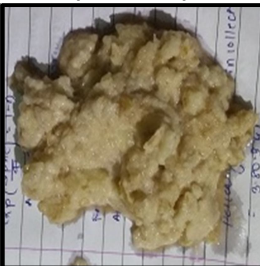
Fig 2.3:- Pretreated Potato