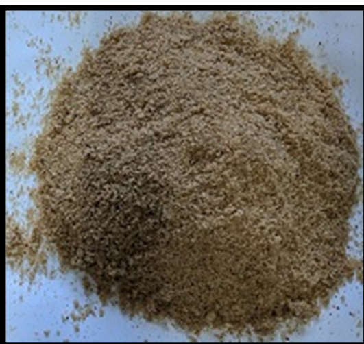
Fig 2.7:- Pretreated Chapati