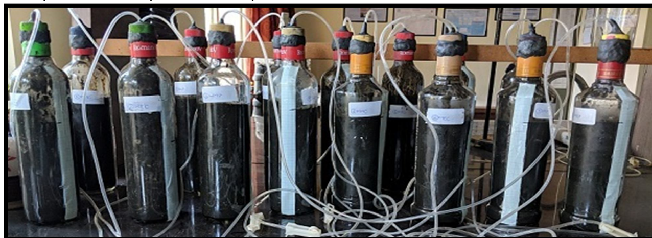
Fig 2.17:- Actual arrangement of reactors.

Below photo shows the implementation of experimentation.