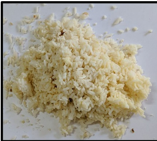
Fig 2.3 Conventional Rice