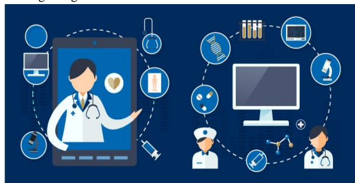
Figure 1: Advantages of EHR