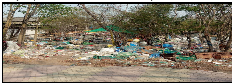
Fig.2. Throwing trash on open land

Examination of city waste completed as of late, uncovers 37.8% effectively compostable (momentary biodegradable) materials, 19.50% hard lignite and long haul biodegradables and 16.20% materials, plastic, elastic and so forth. These last two parts having 35.70% substance in the MSW have turned into a noteworthy reason for concern. These materials are a negative supporter of the preparing plant productivity and quickly exhaust accessible land for land-filling.