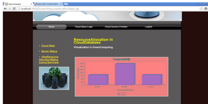
Fig. 3 View Resource Allocation Status