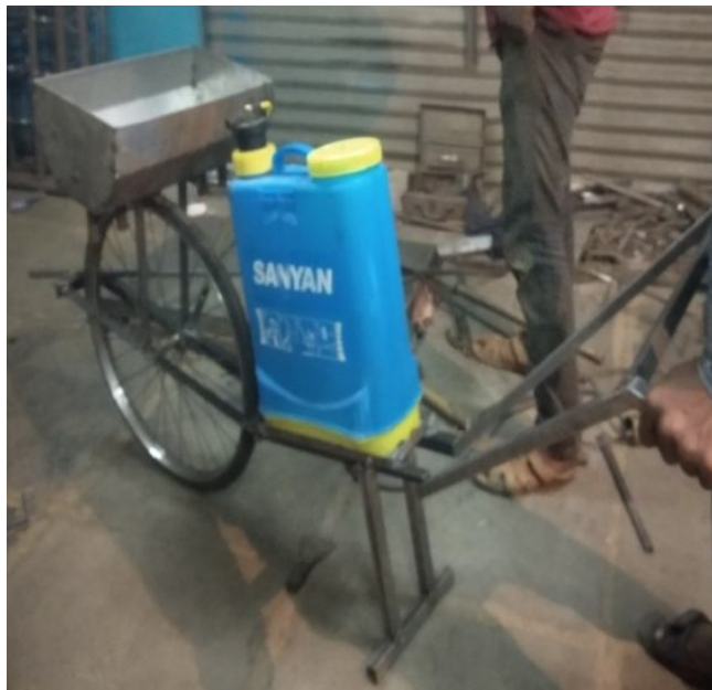
Fig 4 pesticide spraying and fertilizer spreading machine