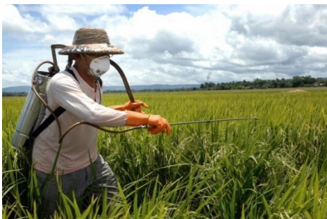
Fig. 1 Backpack sprayer