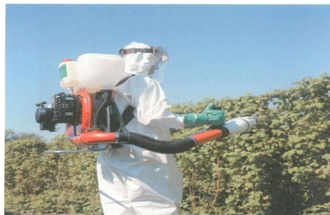
Fig 2 Engine driven sprayer

Fig 1. shows the backpack sprayer machine. Backpack sprayer is fitted with a harness so the sprayers can be carried on the operator back. Tank capacity may be large as 20 liters. A hand lever is continuously operated for to maintain the pressure which makes the backpack sprayers output more uniform than that of a handheld sprayers. Basic low cost backpack sprayer will generate only low pressure and lack feature such as high-pressure pumps, pressure adjustment control (regulator) and pressure gauge found on commercial grade units.